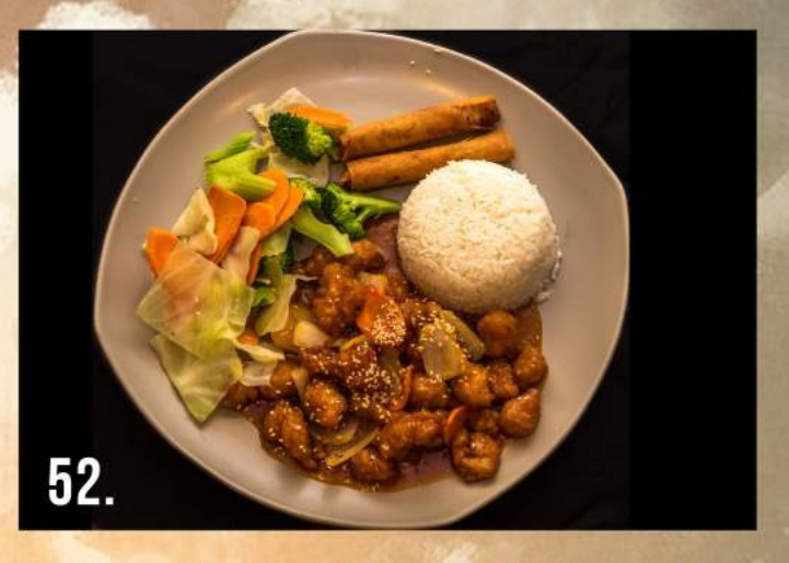
COMBO 2. SWEET AND SOUR CHICKEN OR PORK WTH A BOWL OF STEAMED RICE, STEAMED VEGGIES, AND 2 SPRINGROLLS