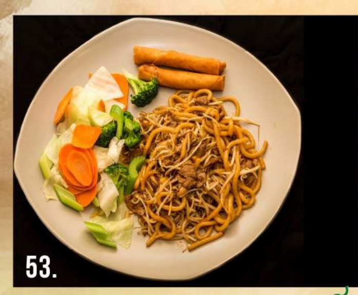
COMBO 3. STIR FRIED UDON NOODLES WITH BEEF, BEANSPROUTS, STEAMED VEGGIES, & 2 SPRINGROLLS