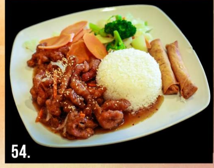
COMBO 4. GINGER BEEF OR CHICKEN WITH STEAMED VEGGIES, STEAMED RICE, & 2 SPRING ROLLS