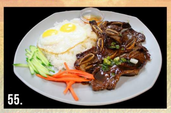
COMBO 5. BEEF SHORT RIBS AND 2 EGGS ON STEAMED RICE