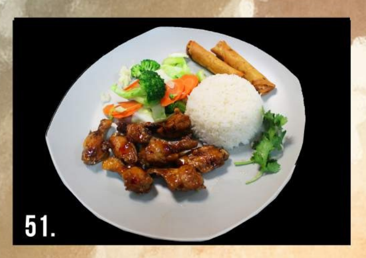
COMBO 1. SWEET CHILLI CHICKEN WINGS WITH A BOWL OF STEAMED RICE, STEAMED VEGGIES, AND 2 SPRINGROLLS